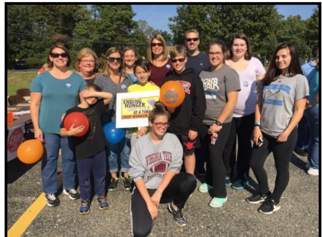
Team Cornerstone from last year's walk!

We have started a Summer Shoebox Shipping Collection for Samaritan's Purse! Each fall our church participates in Operation Christmas Child, where we pack shoeboxes with gifts for children in need throughout the world. It costs $9 to ship each box and our typical goal is to fill 100 boxes. To get a head start on collecting for this $900 expense, we will be collecting loose change throughout the end of September. There is a shoebox on a back table on Sundays where we are collecting donations, or you can place your donation in the offering plate. Thank you for your support of this mission project!