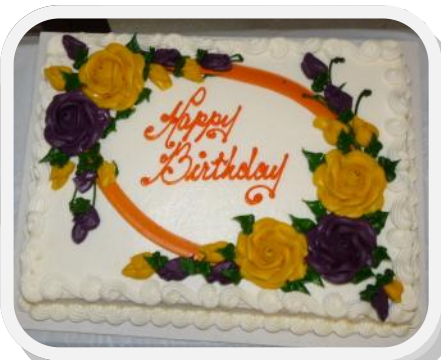
Celebrating October birthdays!