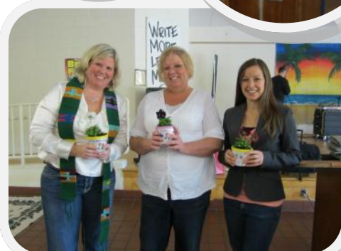
Our first Blue Jean Sunday, 10/14