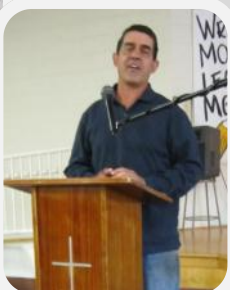
Moments for Stewardship: During the stewardship season, speakers share with the congregation what Cornerstone and their faith mean to them, and why they give.