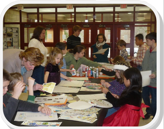
Preparing for the Christmas Play