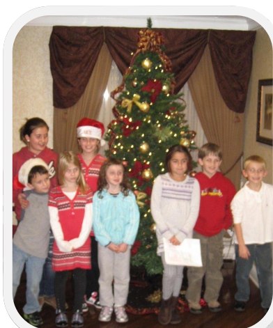
Children's Ministry Caroling at Care One