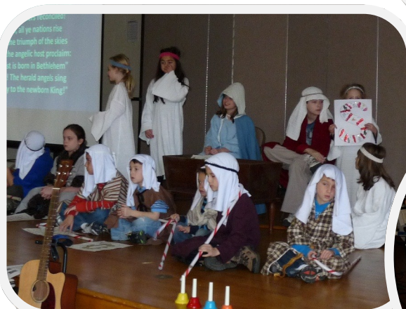
Children's Play "A Christmas Alphabet" 12/18