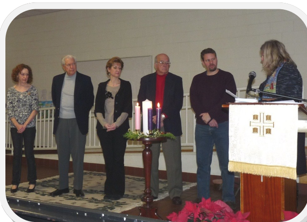
Installation of new Elders and Deacons 12/18