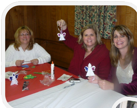
Advent Celebration and Caroling 12/11