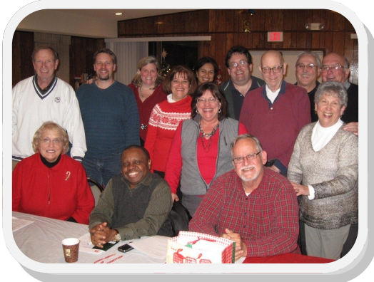
Our Cornerstone Session!