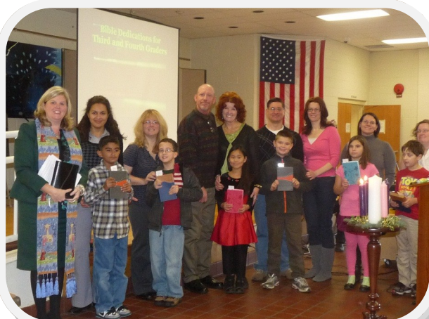
Bible Dedications for 3rd & 4th Graders 12/4