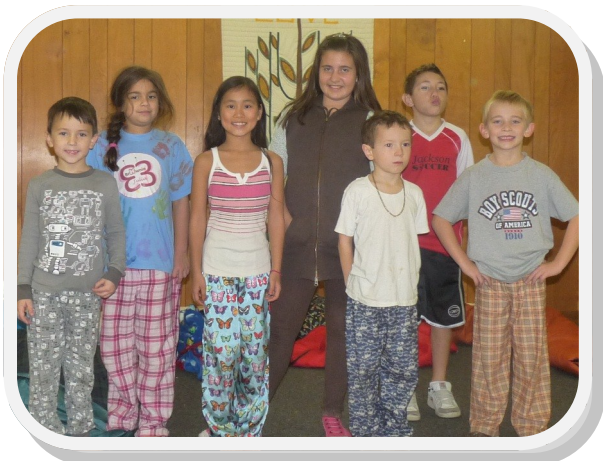
Children's Ministry Sleepover at DeBows 12/2-12/3