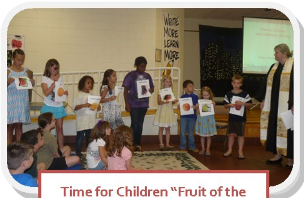
Time for Children "Fruit of the Spirit"—August 14, 2011

Join us to celebrate World Communion Sunday on October 2nd.