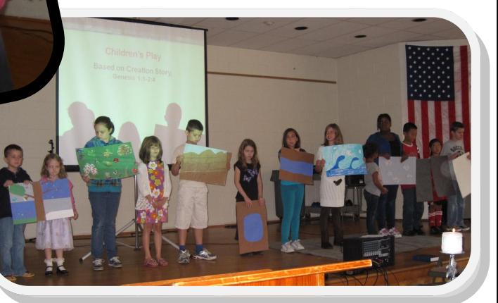
Children's Creation Play on 9/18

The Worship Team voted that on a few Sundays a year, we will use prayer buckets for people to write down their prayer requests during church. The prayers will be emailed and shared. We will use prayer buckets on October 2nd, but most Sundays of the year we will continue to verbalize our prayer requests during church.